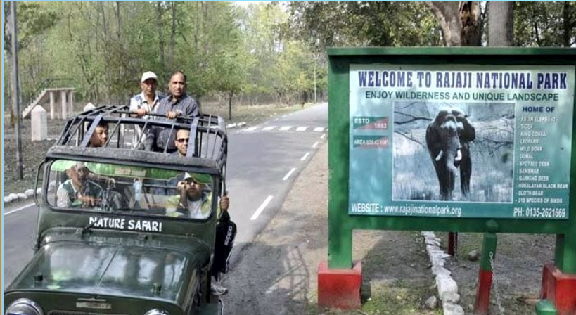
RAJAJI NATIONAL PARK & TIGER RESERVE