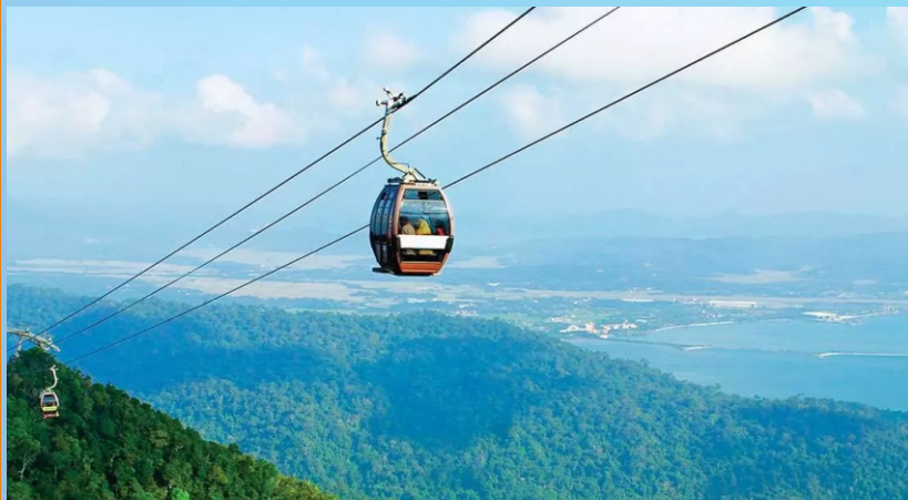
DEHRADUN MUSSOORIE ROPEWAY