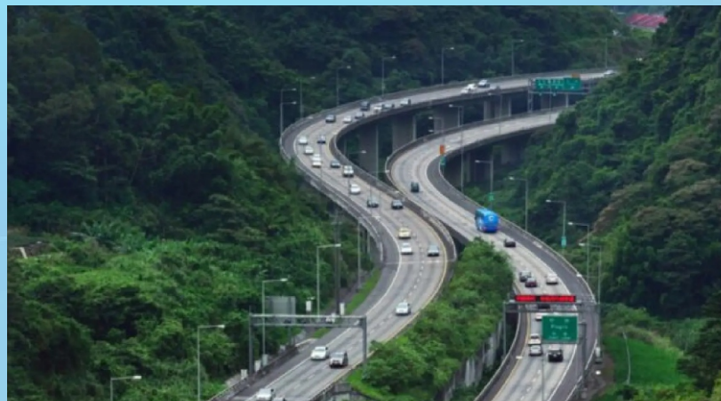
DEHRADUN WILDLIFE CORRIDOR