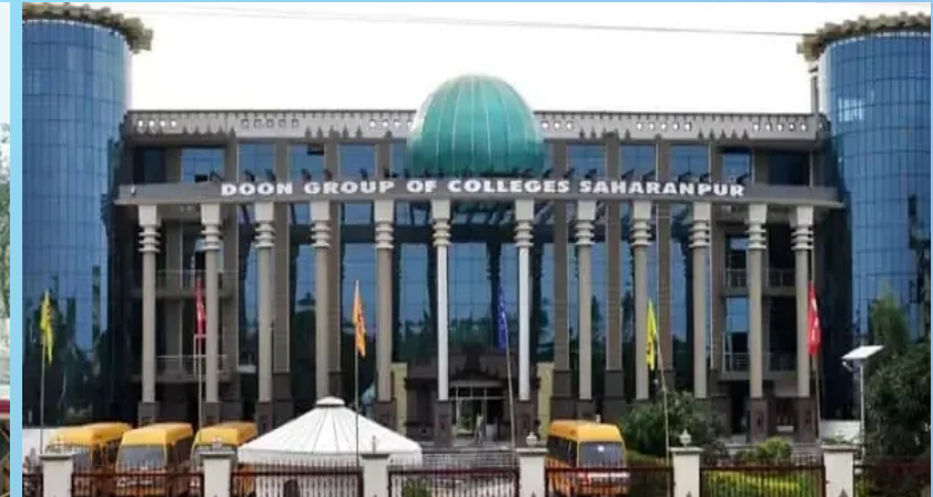
DOON GROUP OF COLLEGES